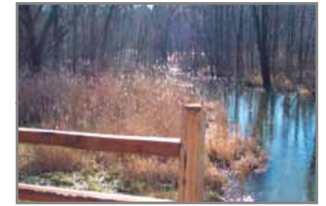
View of the Stony Creek from the trail

As it rides the 1879 rail bed of the Michigan Airline Railroad, later to be acquired by the Grand Trunk Railroad, the Clinton River Trail enters Rochester following a much older route of transportation, the Clinton River. Surfaced with crushed limestone, Rochester's 2.5 mile portion of the Clinton River Trail runs parallel to the meandering river, crossing both Paint Creek and Stony Creek. In Rochester, Clinton River Trail users have access to the Paint Creek Trail via the Downtown Rochester River Walk, as well as the Macomb Orchard Trail to the east. Portions of the trail provide users with forest views, vistas of the Clinton River, and frequent wildlife sightings, including deer, red tailed hawks, groundhog, and fox.