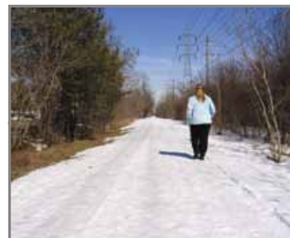
Out for a walk on a brisk winter day