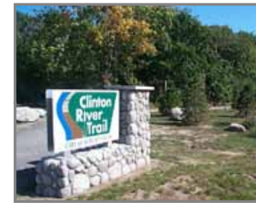
Trailhead at Opdyke Road