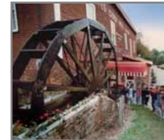
Yates Cider Mill near the trail Nature Study Area to Riverbend Park in the west and Bloomer Park in the east, all of which provide access to the Clinton River. Yates Cider Mill, Meadow Brook Hall at Oakland University, the Velodrome at Bloomer Park, and Rochester College are all places of interest to stop and visit along the way.

The Clinton River Trail bisects the City of Rochester Hills. The habitat along this 4.5-mile portion of the trail is unique in its diversity and creates many opportunities to view and enjoy a host of wildlife species. Deer are common in the brush, muskrats and mink can be seen in the many wetlands, and the oak forests are home to numerous mammals and birds. This trail is an important wildlife corridor and connects the centrally located Avon Nature Study Area to Riverbend Park in the west and Bloomer Park in the east, all of which provide access to the Clinton River. Yates Cider Mill, Meadow Brook Hall at Oakland University, the Velodrome at Bloomer Park, and Rochester College are all places of interest to stop and visit along the way.