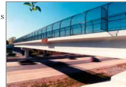
Pedestrian bridge spanning I-75

Opened in 2003, the Auburn Hills portion of the Clinton River Trail is 2.2 miles in length and runs east-west between Adams Rd. and Opdyke Rd. The 25-acre linear park is highlighted by a pedestrian bridge spanning I-75 that connects neighborhoods, schools and the Village Center Area in the city. The unique trail surface comprised of asphalt millings is ideal for biking, walking, jogging and cross-country skiing. Several off-street pathways link to the trail in various locations throughout the city. Parking is available at the trailhead located on the east side of Opdyke Rd., 1/2 mile north of South Blvd.