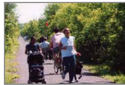
Trail enthusiasts out on a bright summer day