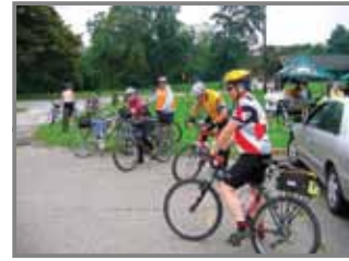
Riders gather at Beaudette Park

At the turn of the century, the City of Pontiac served as the crossroads of railroad transit in Oakland County. Today, the city's portion of the Clinton River Trail begins at the Sylvan Lake border and runs northeast toward Pontiac's Historic Downtown. While traveling along this section, trail users will cross over Telegraph Road and pass by Beaudette Park where parking, restrooms, picnic areas, and boating and fishing facilities are available. Continuing east from Beaudette Park, the trail parallels and crosses over a portion of the Clinton River in a wooded setting before emerging into a primarily residential area at Bagley Street. This is the junction of the Downtown Pontiac Spur to the north and the Temporary Pontiac Route to the south.