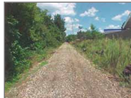
Clinton River Trail near City Hall