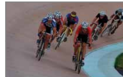
Velodrome at Bloomer Park