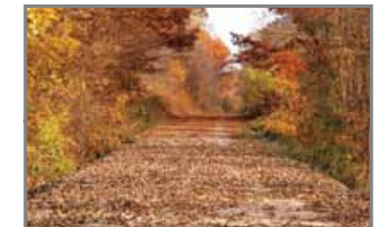
Clinton River Trail in the fall of 2004