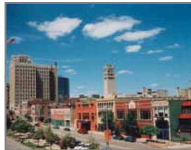
Historic Downtown Pontiac

**Until the entire northern route is constructed, the Temporary Route (see map) will be in place along Bagley Street to South Blvd to Opdyke Road and link to the Auburn Hills portion of the Clinton River Trail.**