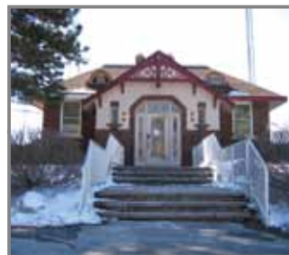
City Hall adjacent to the trail

Once a part of the first interurban railroad service in Oakland County, this portion of the Clinton River Trail now provides a non-motorized linkage from the West Bloomfield Trail to Pontiac. The trail begins at Sylvan Manor Park and cuts through the southern portion of Sylvan Lake in a southwest-northeast direction on its way to the City of Pontiac. As you travel along the trail through Sylvan Lake, you can explore the City's main commercial district along Orchard Lake Rd. This 1.25-mile section of trail connects neighborhoods with local businesses, City Hall, schools and recreational facilities.